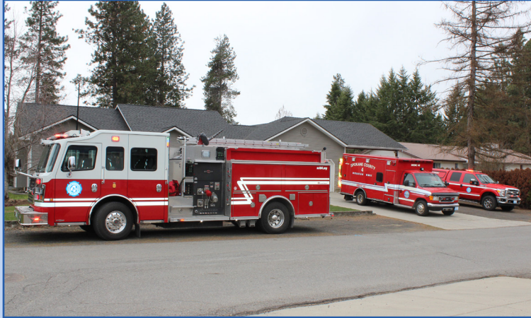
Medic 40, Medic 42 & Engine 41 on a Call

Call volumes jumped 18 percent for Spokane County Fire District 4 in 2021. Of our 4084 calls, 73 percent were medical emergencies. We expect that number to increase as the local population ages and the growth in the northern part of Spokane County continues to increase at unprecedented rates.