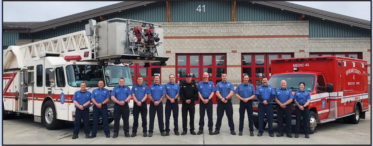
New full-time staff

With winter winding down, I believe we are all ready for spring, sunny days, and a little warmer weather.